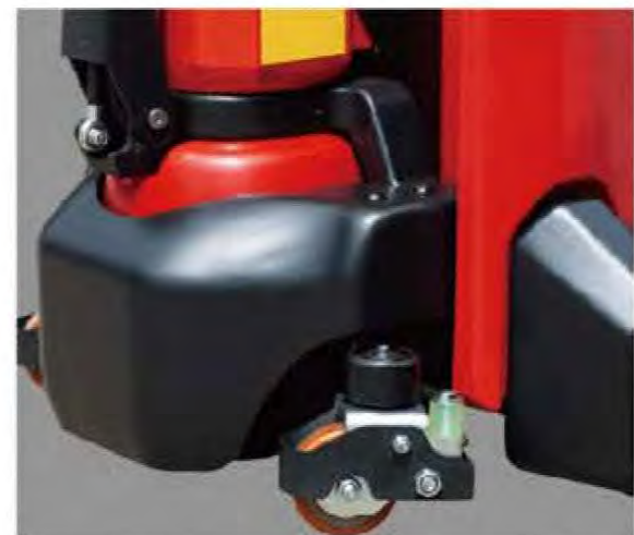
Optional stability casters