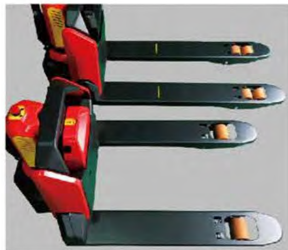
Optional different fork sizes