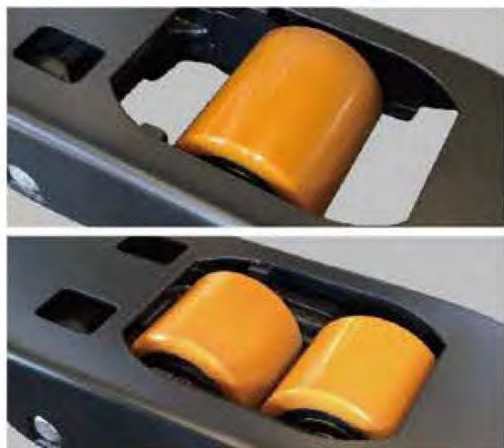
Optional tandem fork rollers